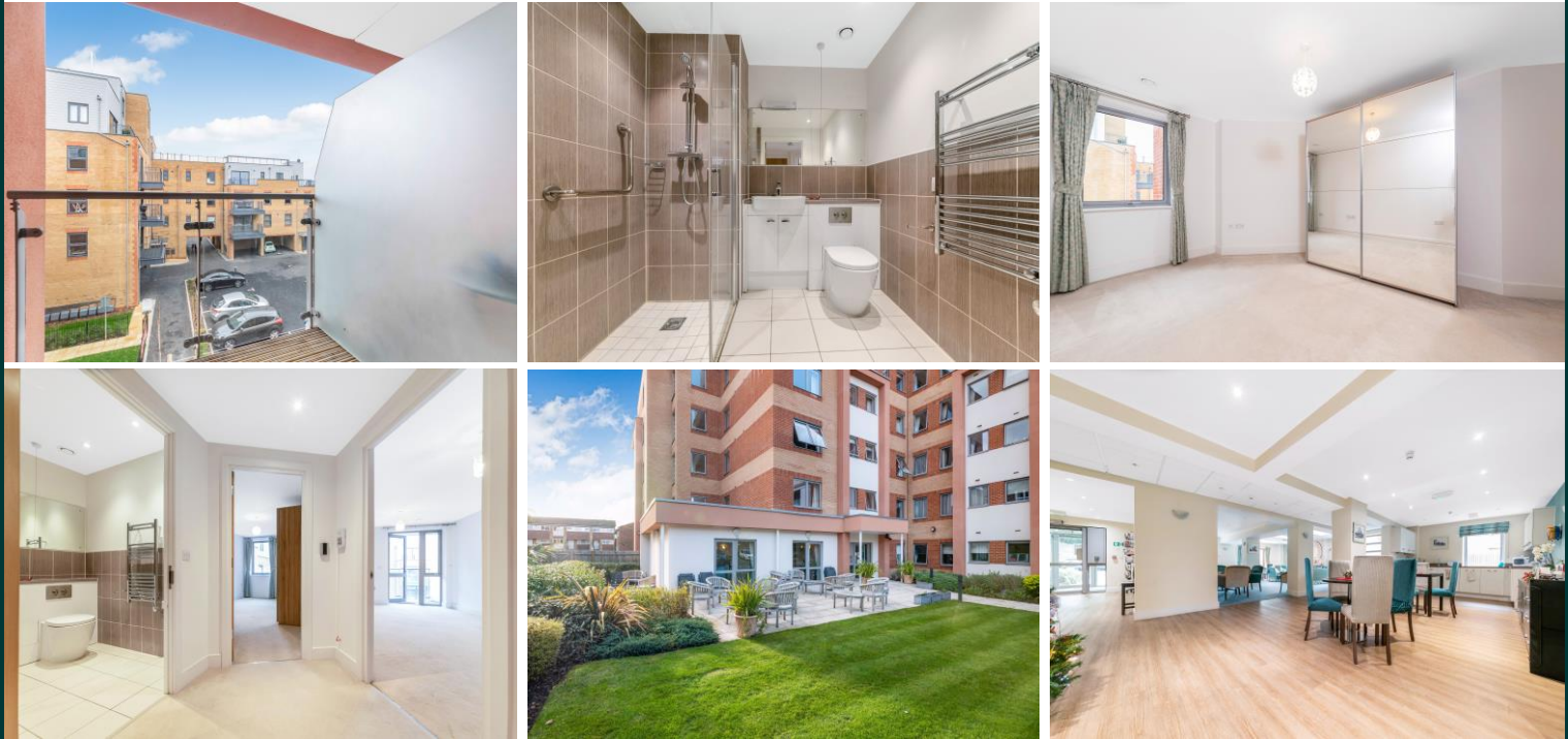
Sidcup Hill, Sidcup, Kent, DA14 Approximate Gross Internal Area = 53.7 sq m / 578 sq ft

COUNCIL TAX BAND: C LEASE TERM: 992 YEARS